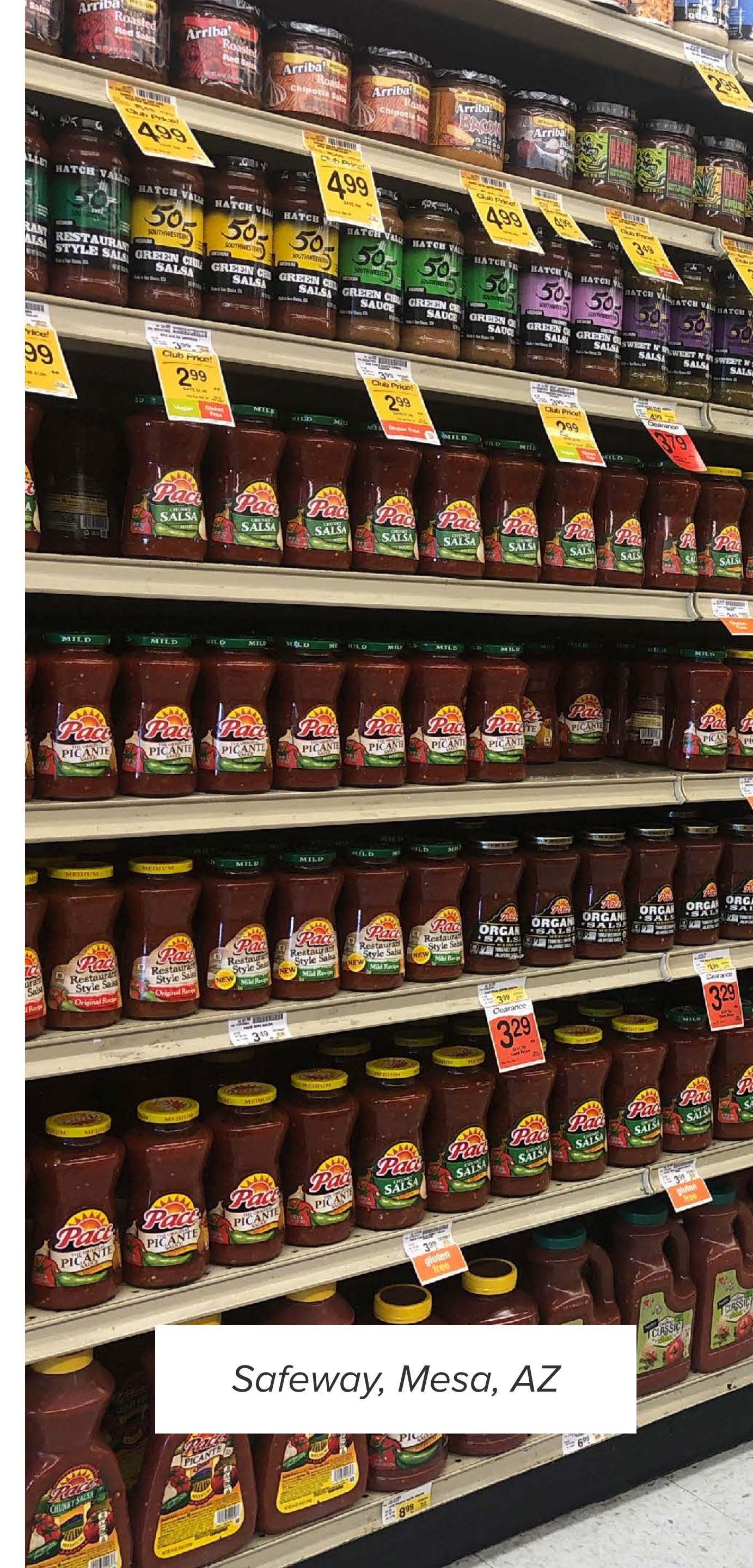
Safeway, Mesa, AZ

Ultimately, Pointer needed to see in stores.