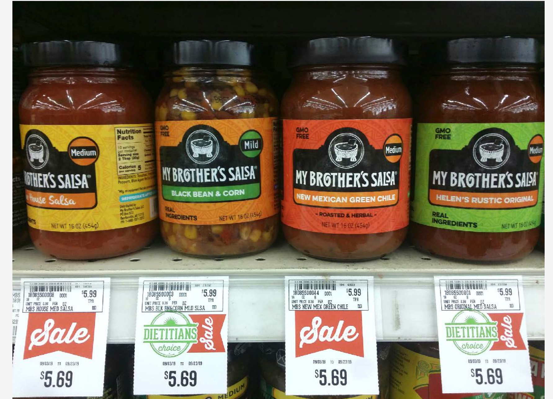
Harmons, Orem, UT

“If we have a question about a chain and if they are actually executing a promotion, your pictures show whether our tags are up.”