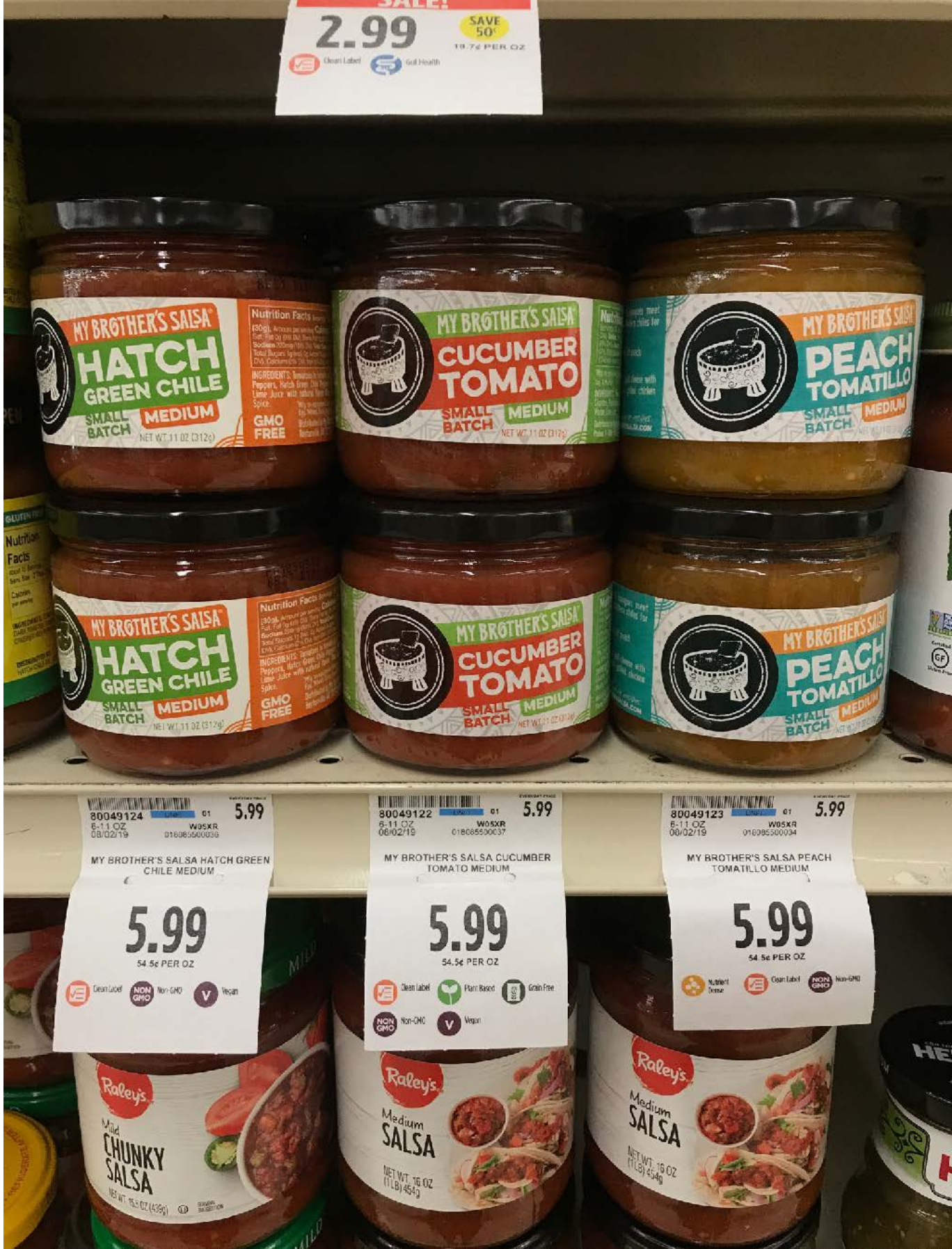
Raley's Folsom, CA