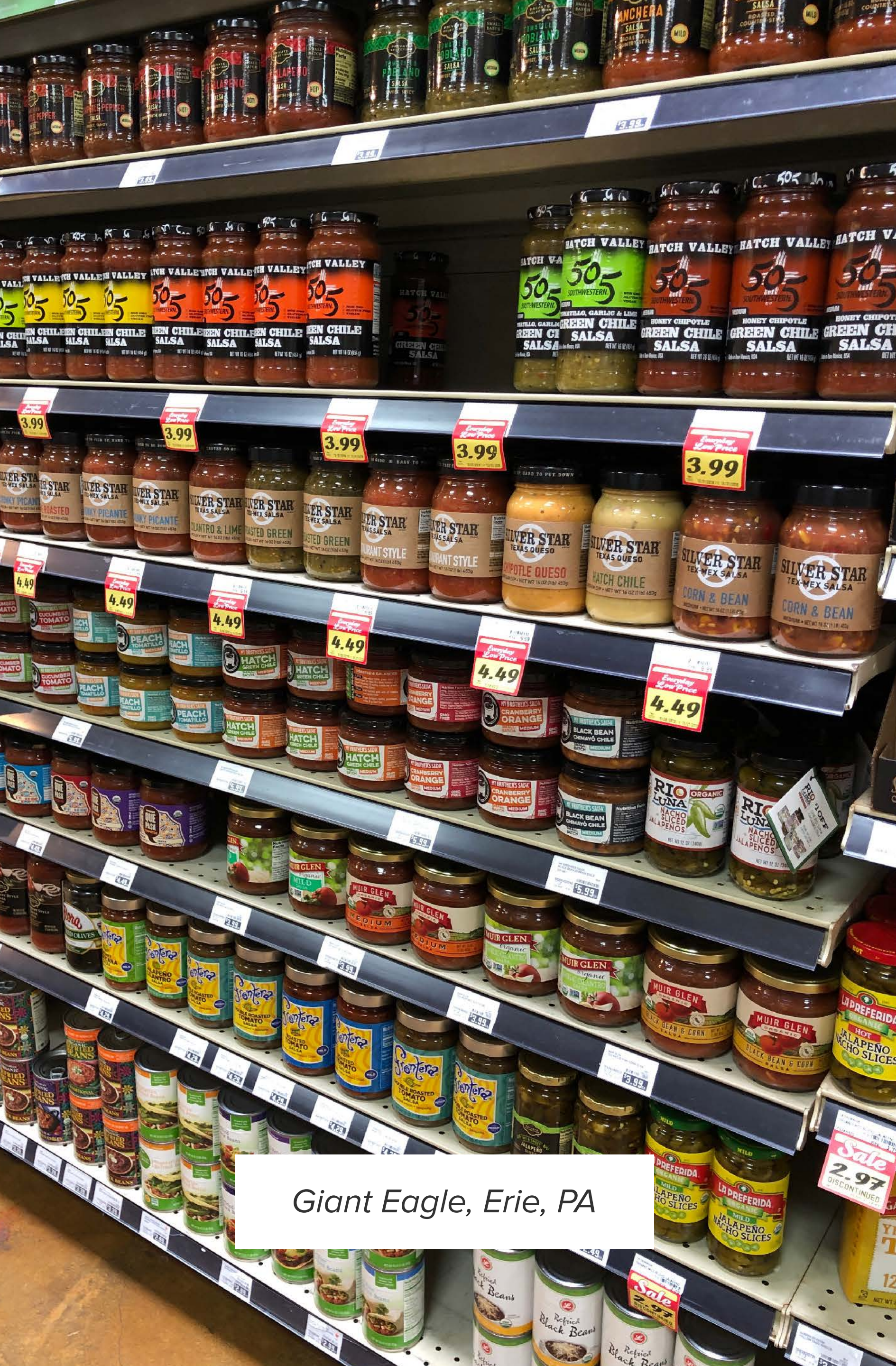
Giant Eagle, Erie, PA